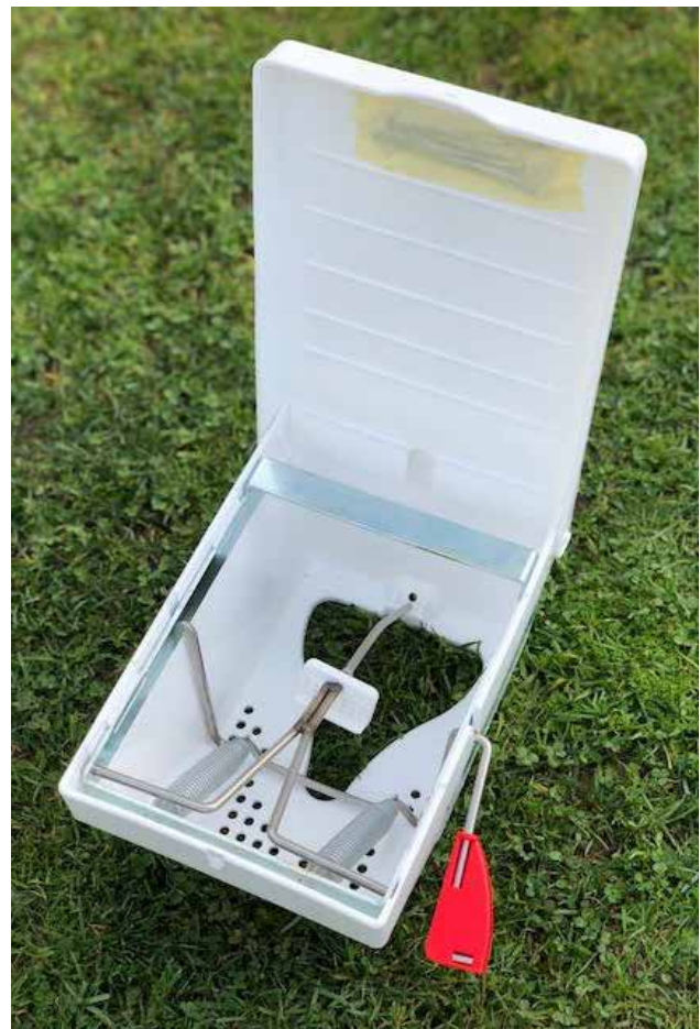
Trapinator possum trap (top). Bait station (below)