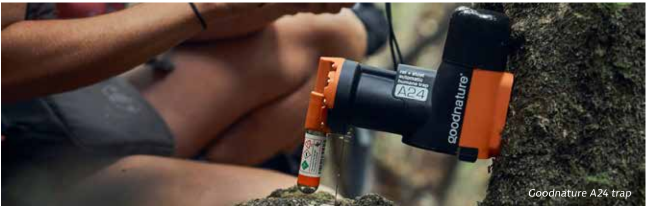
Goodnature A24 trap