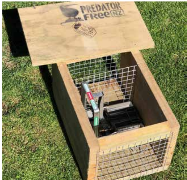
DOC 200 wooden box trap