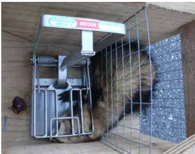
Small ferret caught in a DOC 200 wooden box trap

Note: Possums can eat large amounts of Pindone pellets. If you have a CSL then Feratox (encapsulated cyanide) is a good product to reduce this, or place kill traps at bait stations.