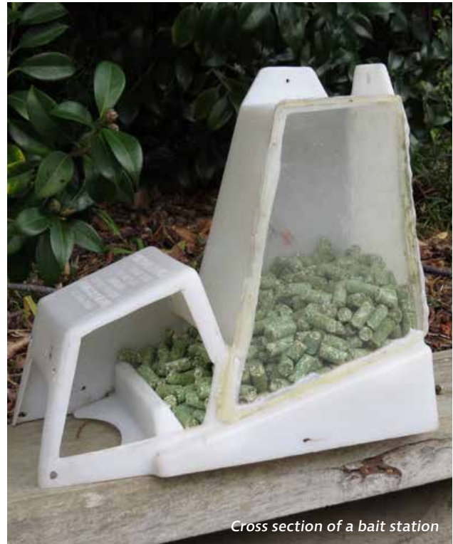
Cross section of a bait station

Note: Possums can eat large amounts of Pindone pellets. If you have a CSL then Feratox (encapsulated cyanide) is a good product to reduce this, or place kill traps at bait stations.